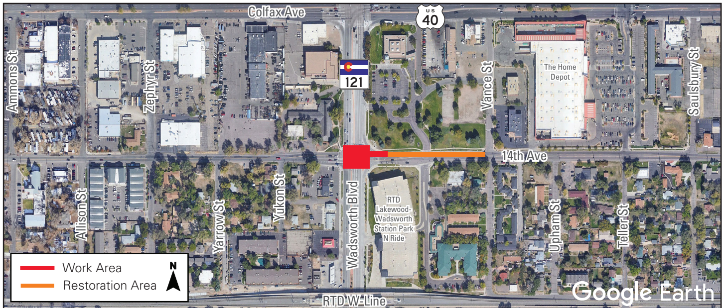
This map is a graphic and may not show exact locations.