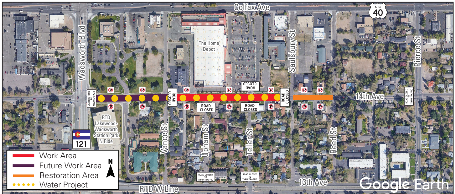
This map is a graphic and may not show exact locations.